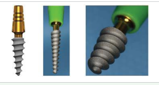
Figure 1: One-piece implant with a compression thread.

In the front region, implants of 14mm length and 3.5mm diameter