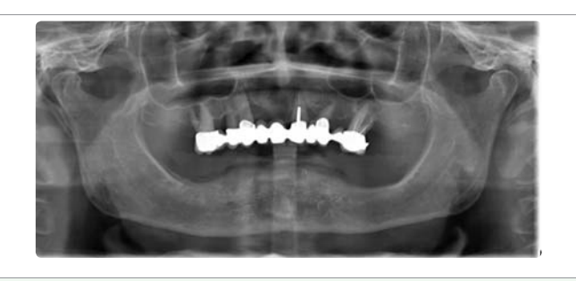
Figure 2: Panoramic radiograph of patient at presentation showing edentulous lower arch with resorbed alveolus and remaining upper teeth.

When compared to conventional implants, one piece implants are cost-effective, they eliminate the need for cover screws, healing