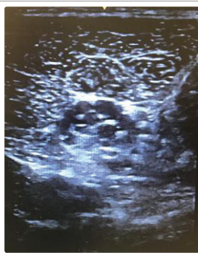
Figure 2: Tibial nerve.

was considered but not performed as the patient's history of scoliosis would have made this anesthetic significantly more challenging. We utilized ultrasound, as demonstrated by Desai, et al. [6] to safely guide popliteal nerve blockade. Our ultrasound scan of the popliteal fossa using a linear probe demonstrated multiple hypoechoic structures within the popliteal nerve. These hypoechoic structures were concerning for neurofibromas, as seen in the report by Rocco and Rosenblatt [7]. The common peroneal and tibial nerve branching was not easily identified as they should have been seen converging from the popliteal nerve. As seen in figure 1, there were concerns for having adequate local anesthetic infiltration of the endoneurium as well as considerations for nerve damage and an insult to the neuromas with an inadvertent puncture of the nerve by the 22G short-bevel needle. A more caudal approach was utilized to block the right superficial and deep peroneal nerves, and tibial nerve as seen in figure 2.