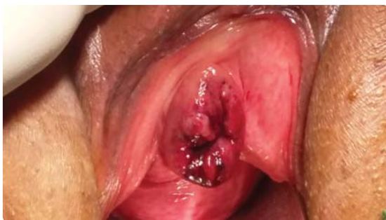
Figure 1: Physical examination showing erythematous, polypoidal mass surrounding the urethral meatus.

A 60 year old female presented to the gynecology department of our hospital with a mass protruding from the introitus and intermittent urethral bleeding since past 3 months. She was examined and referred to the urology department for further management. Physical examination revealed an erythematous, polypoidal mass surrounding the urethral meatus (Figure 1). The lesion was 3 cm in diameter and firm in consistency and was not friable. Rest of the clinical examination did not reveal any significant findings. Hematological investigations revealed a mild anemia with hemoglobin level of 9.7 gm%. Iron studies and coagulation studies were within normal limits. Ultrasound sonography abdomen and pelvis showed no significant pathology. Urethrocystoscopy was done which showed that the tumor was prolonged until the distal third of the urethra and easily bleeding. The cystoscopy was able to cross the tumor and to explore the posterior urethra, bladder neck and bladder which appeared normal. As it was a distal solitary lesion, decision was made to do a wide excision of the lesion. After the excision, the urethral mucosa was everted and sutured over an indwelling Foleys catheter. The