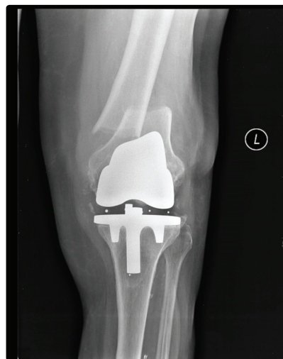
Figure 1: The preoperative AP (1) and lateral (2) x-rays of the patient demonstrating a Rorabeck type 2 supracondylar displaced periprosthetic fracture

With the patient under Laryngeal Mask Airway (LMA) anesthesia, a CACEF System (The Smart Correction®) was applied (Figure 3). The fixator was performed with the patient in the supine position under image-intensification guidance. Two half-pins and a tensioned wire were inserted through the distal ring and distal to the fracture line. Two half-pins were inserted into the proximal ring and proximal to the fracture line. The device consisted of 6-strut construct for connection of special frames. We didn't make any effort for reduction intra operatively. So operative time was just 35minutes. The patient tolerated surgery well and made rapid recovery postoperatively.