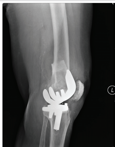
Figure 2: X-rays of the patient demonstrating a Rorabeck type 2 supracondylar displaced periprosthetic fracture