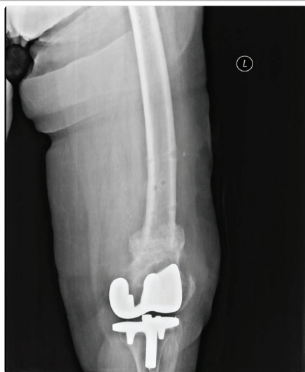
Figure 4: Postoperative AP (4) and lateral (5) x-rays of the same patient showing an uncomplicated full bony healing.