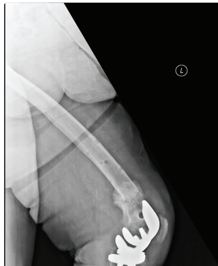
Figure 5: X-rays of the same patient showing an uncomplicated full bony healing.

basis of surgeon comfort level and experience because the literature does not provide conclusive evidence of one treatment being better than another. Recently, locking plates have been popularized due to providing tight fixation but also load sharing properties, however, complication rates of this technique remain high with up to 13% failures [10]. Surgeons still concerned about opening a fracture by using excessive surgical approaches in the presence of a well-functioning prosthesis.