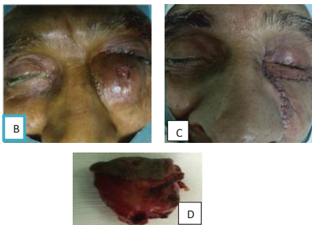
Figure 2: B, C & D) Photography of case 1 of the operative aspect of the lacrimal duct tumor and the patient before and after surgical resection