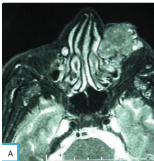
Figure 1: A) MRI of case 1 shows an irregular-shaped tumor involving the left lacrimal sac, inferior eyelid and sinonasal tract.

A 64-year-old man, chronic smoker, presented to our department for a 6-month history of a left medial canthal mass. The preoperative Computed Tomography (CT) and Magnetic Resonance Imaging (MRI) showed an irregular shaped tissular lesion involving the left lacrimal sac, lower eyelid and sinonasal tract. Surgical biopsy confirmed the diagnosis of squamous cell carcinoma. The patient underwent only surgical treatment consisting of wide excision of the tumor with health margins. The evolution was good without recurrence after more than 5years (Figure 1 and Figure 2).