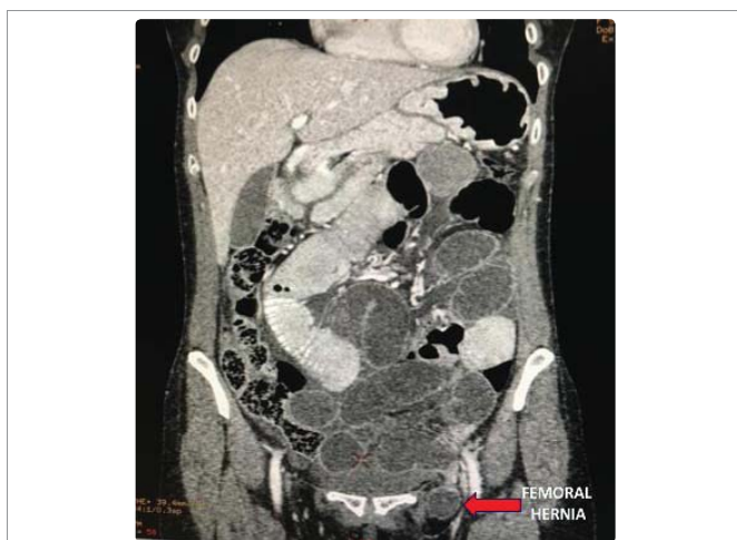
Figure 1: CT showing left femoral hernia and intestinal obstruction.

Although the patient and her family were concerned not only because her medical condition, but also because the circumstance of the imminent wedding, imploring to go to the ceremony, she underwent emergency laparoscopy to perform surgical TAPP repair. A 10 mm umbilical trocar was introduced to the abdominal cavity by a semi open blunt primary access technique, and two additional 5 mm