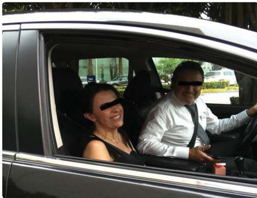
Figure 4: The patient on her way to the wedding 6 hours after the procedure.

use is still debated by some [1]. But even in these cases of urgency with incarceration or strangulation has demonstrated its usefulness and safety [2-5].