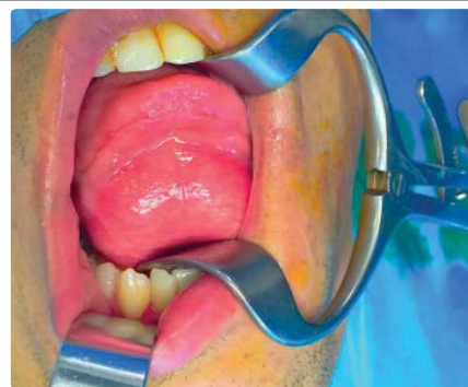
Figure 1: Examination of the oral cavity, revealed a sublingual swelling measuring 5 cm occupying the entire floor of the mouth.

The epidermoid cyst is a benign tumor, included in the group of dermoid cysts. It is a rare tumor; it represents 1.6 to 6.9% of all cysts in the head and neck area [1]. However, in the floor of the mouth the epidermoid cyst represents 1.6% of cervico-facial dermoid cysts [4]. However, other locations have been reported in the literature, namely the tongue, lips and oral mucosa [5]. Concerning the physiopathology of the epidermoid cyst of the oral floor, there are two theories in function if the cyst is congenital or acquired. The congenital cyst is the result of trapped ectodermal tissue of the first and second branchial