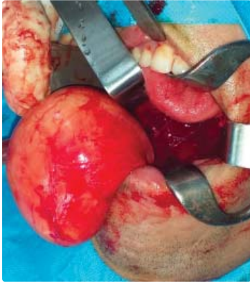
Figure 3: Surgical excision of the totality of the cyst.