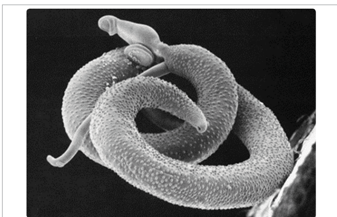
Figure 2: Schistosoma Mansoni , electronic microscope view.

Schistosomiasis is the infection of humans by trematodes (a class of helminths). Three major species of schistosomes are described: S. haematobium , S. japonicum , and S. mansoni [14].