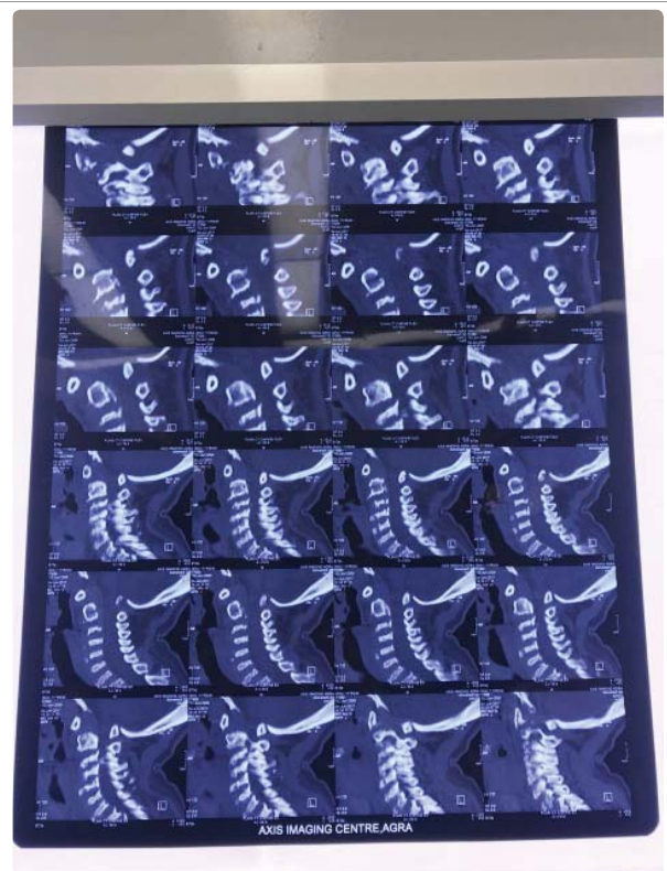
Figure 5: Plain CT cervical spine reveals anterior displacement of atlas vertebra causing narrowing at craniovertebral junction leading to compression of cervical cord suggestive of compressive myelopathy. Hypoplasia of odontoid process was reported. The visualized vertebrae with anterior beaking (platyspondyly) and normal intervertebral disc spaces.