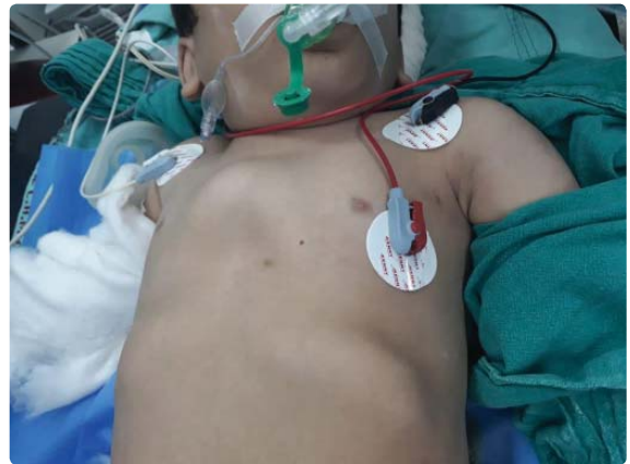
Figure 9: Picture showing anesthetized patient with characteristic pectus carinatum and rib deformities.