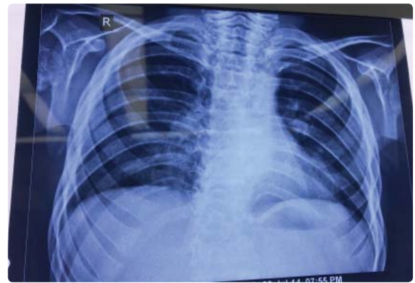
Figure 4: Digital skiagram Chest Xray PA view reveals normal study.

After a thorough pre anesthetic check-up and an adequate fasting of 8 hours, patient was carefully transferred onto the operating room table where the routine noninvasive monitors were applied (EKG, noninvasive blood pressure monitor, pulse oximeter, end tidal CO 2 monitoring, precordial stethoscope). Difficult airway cart was kept ready in the OR. An intravenous catheter was placed and intravenous dose of 0.08 mg of glycopyrrolate as pre-medication was administered. After preoxygenation with 100% oxygen, anaesthesia was induced via inhalation with 4% sevoflurane along with injection fentanyl 40 micrograms and injection propofol 50 mg. Slight airway