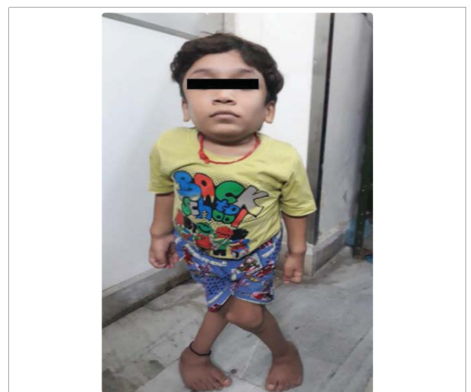
Figure 1: Front view of the patient.

All these findings were consistent with the associated osteogenesis defects (dysostosis multiplex with MS) [8]. Digital skiagram of bilateral pelvis and hip in AP view (figure 3) reported widened deep acetabular cavity with small sacro-sciatic notch resulting in triangular pelvic activity. There was evidence of small bilateral femoral capital epiphysis with crested appearance of epiphysis of greater tuberosity.