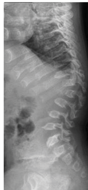
Figure 10: Lateral view spine revealing spine deformities: thoracic kyphosis and exaggerated lumbar lordosis.