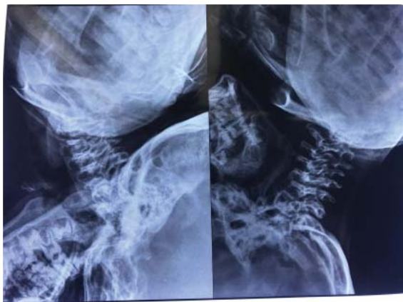
Figure 7: Lateral view of skull and cervical spine in flexion and extension scans.