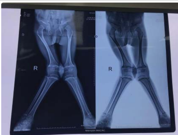
Figure 3: Digital skiagram pelvis and both hip showing widened deep acetabular cavity with small sacro-sciatic notch and evidence of small bilateral femoral capital epiphysis with crenated appearance of epiphysis of greater tuberosity.

obstruction occurred promptly as anaesthetic-induced relaxation of laryngeal structures took place as identified by stridor. This was easily relieved with the two-handed jaw-thrust maneuver. As the patient became more deeply anaesthetized, LMA proseal 1.5 number was inserted with minimal movements at atlanto-occipital junction while practicing manual in-line stabilization of spine (figure 8). To aid for analgesia, regional anesthesia via caudal block was decided and the patient was carefully positioned in left lateral position with always someone maintaining neck stabilization. Under all aseptic precautions, caudal anesthesia was administered using 22 gauge caudal needle and 10 ml 0.25% bupivacaine with 400 micrograms