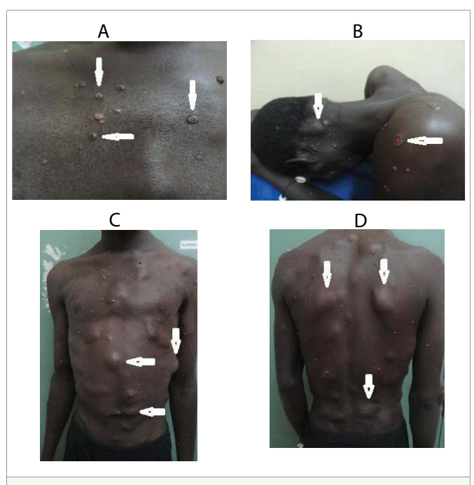
Figure 1: A: Papules ombiliquees. B: Severe papule and nodule. C,D: polymorphic lesions diffuse (papules and nodules tumors).

The parasitological examination of the dermal juice after colouring with the Indian Ink had shown the presence of Cryptococcus spp (Figure 1a). The identification after culture had not been carried out because after first negative fungal culture the patient did not honor the second appointment with the mycologist for a second culture. The pus was sterile to the bacteriological research. Histopathological examination of a umbilicated papule and a fragment of nodule had noted an inflammatory and granulomatous reaction consists mainly of giant cells type Muller. Into the granulomatous reaction was many small yeasts often phagocytosed by macrophages with many nucleus, visible to the (Figure 2b) and the Gromori Grocott (Figure 2c and 2d). There was no tuberculoid granuloma and no necrosis. The retroviral serology was negative. Serologies of the viruses of hepatitises B and C were not carried out. Pulmonary radiography was normal. The patient has been treated by Fluconazole 300 mg/ j. It has been lost sight of one week after its implementation under treatment for the benefit of multiple traditional treatments in his village. After approximately 6 months without medical follow-up, it was readmitted to our hospital (CHUSS) with acute hepatitis and ascitic fluid which led to the death in hospitalization.