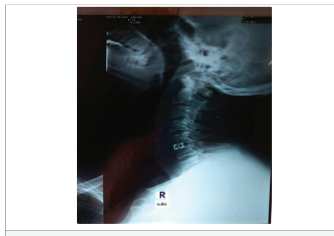
Figure 3: X-ray cervical spine lateral view showing mesh cage at C5/6 level.