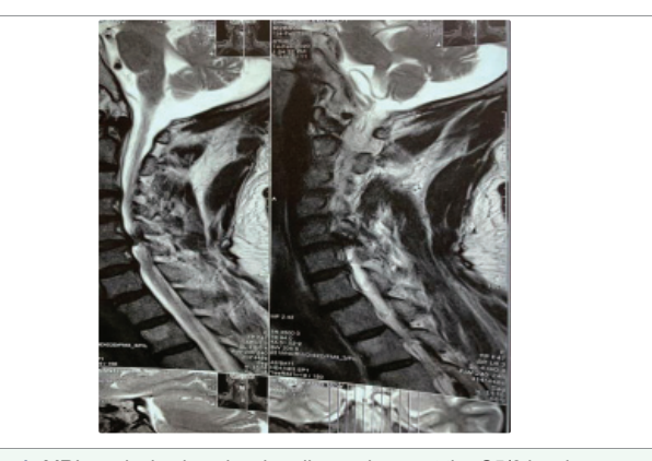
Figure 1: MRI cervical spine showing disc prolapse at the C5/6 level.

An extruded disc was removed from the left side of the same level (Figure 1,2). The patient underwent an anterior cervical discectomy and mesh cage implant for C5/6 spondylotic myelopathy (Figure 3,4) and he recovered well. He was ambulant over two weeks but there were persistent tingling and numbness.