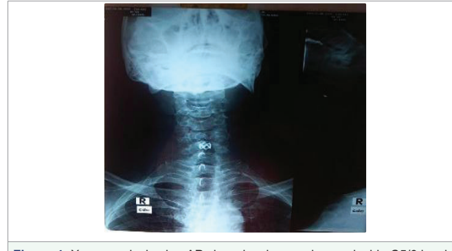
Figure 4: X-ray cervical spine AP view showing mesh cage inside C5/6 level.