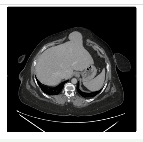
Figure 3: Axial CT scan image (venous phase) shows the herniated liver parenchyma through the epigastric anterior abdominal wall defect, the herniated part appear isodense to the normal liver.