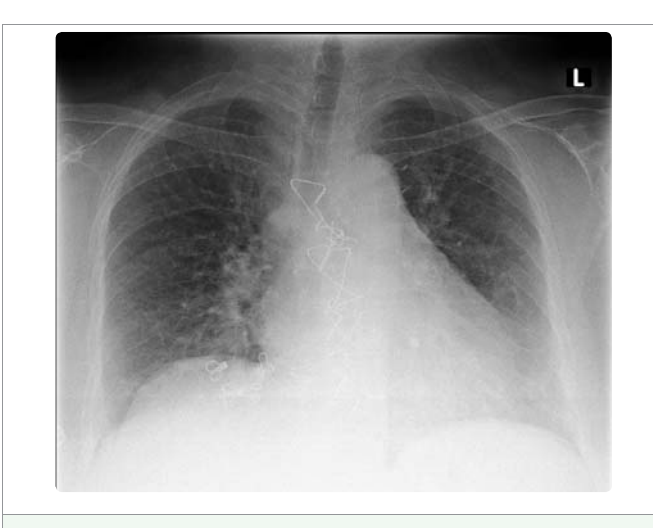
Figure 1: Plain chest x ray showing median sternotomy closure with interrupted stainless steel wires.

Computed tomography abdomen revealed herniation of the left lobe of the liver (figure 1, 2) with surrounded fat through a large epigastric defect just below a previous sternotomy incision (figure 1, 2). The herniated part appear iso-dense to the normal liver. Severe