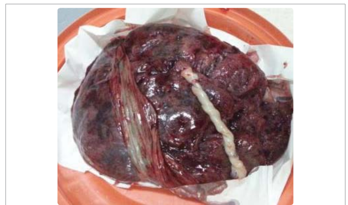
Figure 3: Picture of the placenta of fetus with neck teratoma weighing 800 gm.