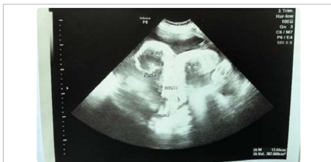
Figure 1: Ultrasound of the fetus at 27 weeks GA showing cervical mass of 10 cm x 5 cm size.

Fetal Neck teratoma is formed at early gestational age and