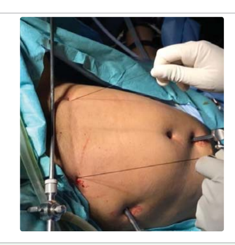
Figure 6: Silk thread taken out via subperitoneal tissue into the skin outside to get fixed into a traction device.

for approximately 8-10 hours per day during the first month. The dilators were made of soft latex, measuring 10cm in length, and were available in three diameters: 1.5cm, 2cm and 2.5cm. After use, patients were instructed to properly wash and sterilize them with antiseptic solution or normal water. Intercourse was allowed twenty days after removal of acrylic olive. All patients were called for follow up visit on day 15 and day 30 post surgery to check the vaginal length. Patients were comfortable and adequate vaginal length of approximately five cm was achieved in all (Figure 8,9).