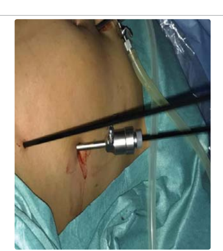
Figure 4: Stab incision adjacent to the lateral port.