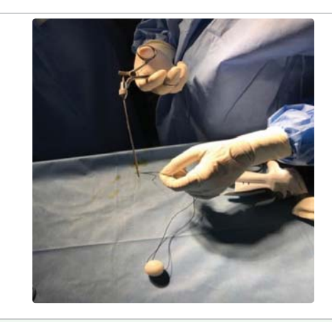
Figure 2: Silk thread fed into olive head needle.

All patients were admitted for a week postoperatively and gradual traction was given every day. Urethral catheter was kept inset for seven days and IV intravenous antibiotics were administered for 24 hours. Patient was started on soft diet from second day post-surgery. Traction was removed on postoperative day-7 and vaginal length was checked. All women were instructed to use dilators (soft and blunt)