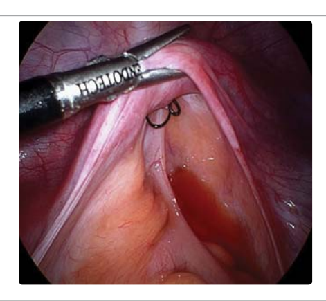
Figure 3: Rudimentary horn held with Maryland.