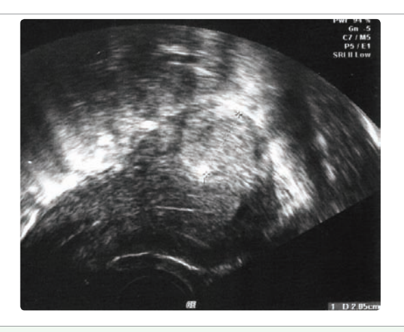
Figure 1: Ultrasound picture of intramural myoma.

Understanding which genes are involved in fibroids does not automatically tell us why fibroids develop or how to control them. From our understanding of fibroid behavior, we would guess that genes involved in estrogen or progesterone production, metabolism, or action would be involved. Unfortunately, science is seldom that