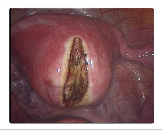
Figure 2: Longitudinal incision of capsule.

Abdominal myomectomy: Abdominal or open myomectomy has its origin in the early 1900s as a uterus- preserving procedure. Today, it is mostly performed for women with intramural or subserosalmyomas and less frequently for sub mucosal localization. Since the introduction of endoscopic procedures, the indication for abdominal myomectomy has become rare. It becomes an option if hysteroscopic or laparoscopic myomectomy is not feasible or if a laparotomy is required for any other reason. The indication to exclude uterine sarcomas has to be taken very strictly; however, uterine sarcoma is a very rare malignancy and the rate of sarcoma after clinical diagnosis of myoma is very low. The risk of severe complications in association with open surgery is higher than with hysteroscopic or laparoscopic moymectomy. Prophylactic antibiotics should be given for any abdominal fibroid operation [52,53]. After the Pfannenstil incision either a vertical or transverse uterine incision is performed [54]. The myoma enucleation is performed by traction on the myometrial edges, e.g. with Allis clamps. After exposure of the