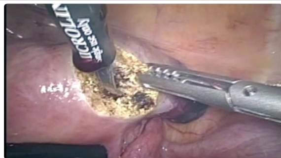
Figure 3: Right cornual wedge resection by scissors and forceps.