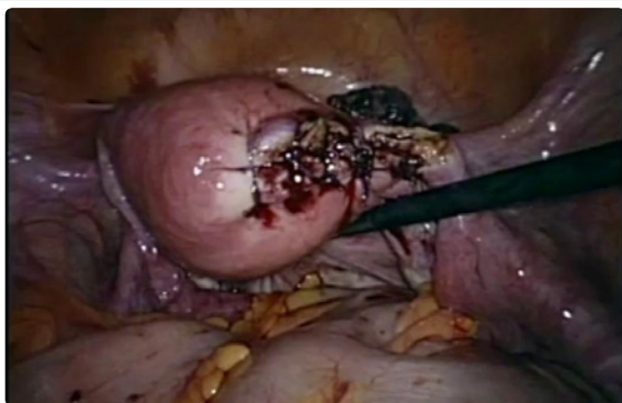
Figure 5: Final result of surgery. Interrupted sutures.