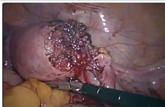
Figure 4: Cornuectomy.

closed by interrupted sutures (absorbable suture, poliglicolic 2-0, Vicryl). (Figures 5,6). Then right salpingectomy was done. The patient was discharged 2 days after surgery.