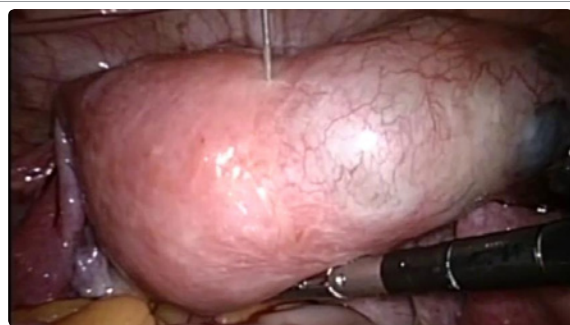
Figure 2: Intramyometrial injection of diluted vasoconstrictor.