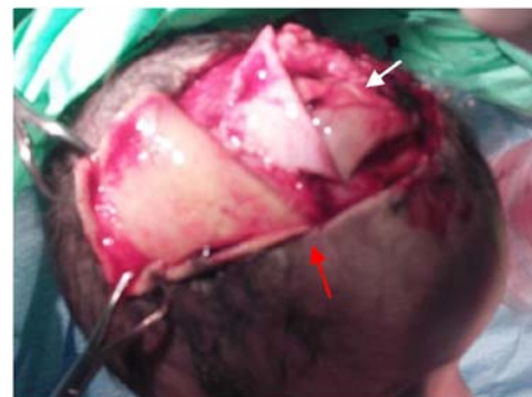
Figure 1: Craniotomy (red arrow) during autopsy shows that the tumour occupies all intracranial space (white arrow) and remnant brain tissue was deformed and hard to identify.

Congenital brain tumours are rare. Intracranial immature teratoma comprises 0.4% of all pediatric brain tumours [7]. It constitutes the most common of germ cell tumours [9]. Teratoma is formed during the first fourth weeks of embryonic development [12]. The prevalence and female to male ratio of teratoma are unclear and the data of the literature are contradictory [13,15-16]. The most common locations for Teratoma are median structure such as cerebellar vermis, quadrigeminal plate, walls of the third ventricle, pineal gland and suprasellar region. Its occurrence in lateral ventricle is extremely rare. The first intracranial teratoma was reported by Breslau [11] in 1864 and the first teratoma of the lateral ventricle