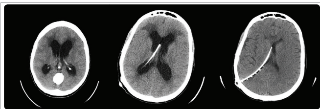
Figure 1: Computed Tomography Scan: Pre, immediate post, and 1-month post ventriculoperitoneal shunt.

hematoma which was clinically observed and resulted in no clinical sequelae. Intraoperative pathology was consistent with Grade II atypical meningioma, Ki 67: < 1%. The patient's hospital course was uncomplicated. She was able to be discharged to a rehabilitation facility on post-operative day three. Patient was at the rehabilitation facility for 8 days prior to discharge home. At the time of discharge, the patient was completely off her Olanzapine. The patient was seen in clinic at the two-week post-operative visits where she and the family endorsed no psychotic symptoms.