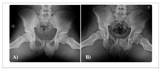
Figure 1: (A) Anteroposterior view of the pelvis with the hips in extension, revealing superior acetabular osteophytes and posterior femoral cam deformity on the left

Anatomically, OOs are typically located in the diaphysis cortex of long bones. In these locations, they present typical symptomatology and require normal imagery. In atypical locations, the diagnosis may become less evident. For example, patients with intraarticular hip lesions have less night pain [1], and imaging-based diagnosis proves more challenging. CT is not able to detect the sclerotic rim around the nidus, which has been attributed to absence of the boneforming layer of the periosteum called the cambium layer [2]. The reactive sclerosis, however, may be a little distant [3]. X-ray can reveal