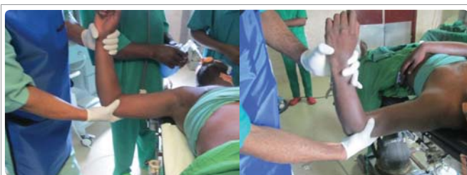
Figure 4: Same patient: External reduction maneuvers: axis traction, external rotation and abduction.