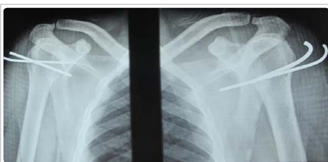
Figure 5: A.Y. 31 years old: the anteroposterior radiographs of the 2 shoulders confirm the anatomical reduction.