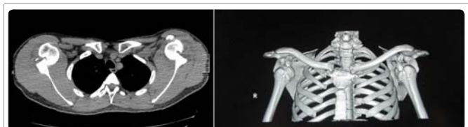
Figure 3: Same patient: computed tomography with reconstruction images: bilateral dislocation with bilateral notch of Malgaigne (or fracture of Hill Sachs).