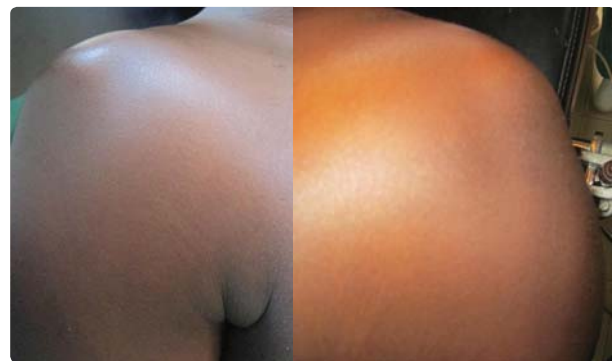
Figure 1: A.Y: appearance of the 2 dislocated shoulders just before reduction maneuvers under general anesthesia.

The biological check-up showed no significant abnormality, particularly a normal fasting blood sugar of 0.90g / l. The Electroencephalographic tracing (EEG) was normal. We programmed emergency surgery to be carried out under general anesthesia including a reduction and internal fixation (temporary arthrodesis by 2 cross pins) and external restraint by the elbow-to-body Dessault bandage. This reduction was done, under general anesthesia with maximum muscular relaxation, and progressive soft maneuvers described by Kocher : traction in the axis of each upper limb, external rotation and abduction [Figure 4].