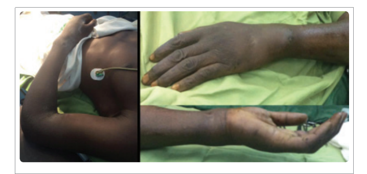
Figure 1: Clinical images of left upper limb showing marked swelling and deformity of elbow and wrist with healing local skin abrasions over the volar and dorsal surfaces of the wrist.

Reconstructed sagittal, axial and coronal Computed Tomography (CT) scans of the wrist confirmed the trans-scapho-trans-triquetrotrans-capitate perilunate fracture dislocation with disorganized and enucleated first row carpal bones at the palmar surface of the distal forearm. The lunate was dislocated volarly and the line connecting the capitate with the axis of the radius passed through the edge of the capitate only. Additionally, the normal rectangular profile of the lunate appeared triangular due to its tilt. There were comminuted scaphoid, triquetrum and capitate fractures. The imaginary line connecting the centers of the radius, lunate and capitate was broken.