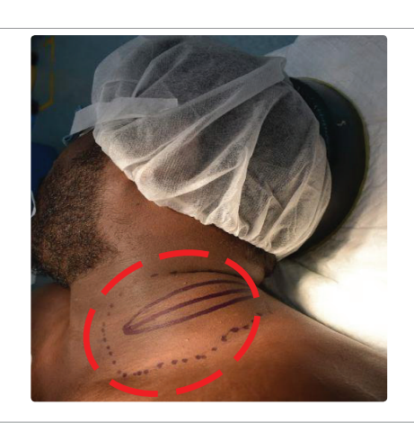
Figure 3: Margin of mass marked at left supraclavicular.