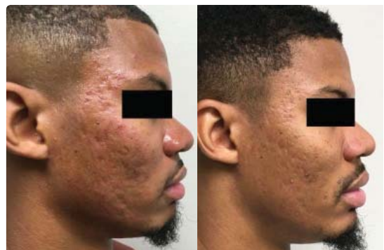
Patient 5: Before Treatment 90 Days after Treatment, Acne Scars and Pigmentation Improved

The fields of Cellular Medicine, Regenerative and Stem Cell Therapies are growing rapidly [21]. Acne serves as a tremendous model for investigating infection prevention, inflammation, wound care, erythema, post-inflammatory hyperpigmentation, and the evolution of several types of scars. Current research, particularly in cellular medicine and regenerative therapy are seeking to further improve patient outcomes by enhancing prevention measures. Nitric oxide applied topically is capable of modulating the skins’ innate