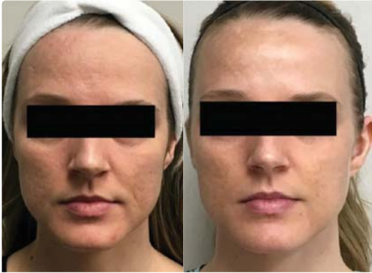
Patient 6: : Before Treatment 30 Days after Treatment, Acne Scars and Texture Improved

active pustules, comedones, and improve the appearance of mild to moderate saucerized scars. By reducing inflammation and increasing keratinization, NO also increases moisture and barrier functions of the skin. The reduction of subclinical inflammation aids in the prevention of scar formation. It is safely applied on open wounds which yields added ant-bacterial activity, maximizing healing and minimizing scar formation.