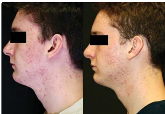
Patient 2: Before Treatment 30 Days after Treatment, Acne and Erythema Improved.