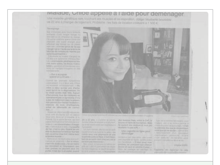
Figure 3: A woman with an Ehlers-Danlos published by Ouest France, a french Newpaper.