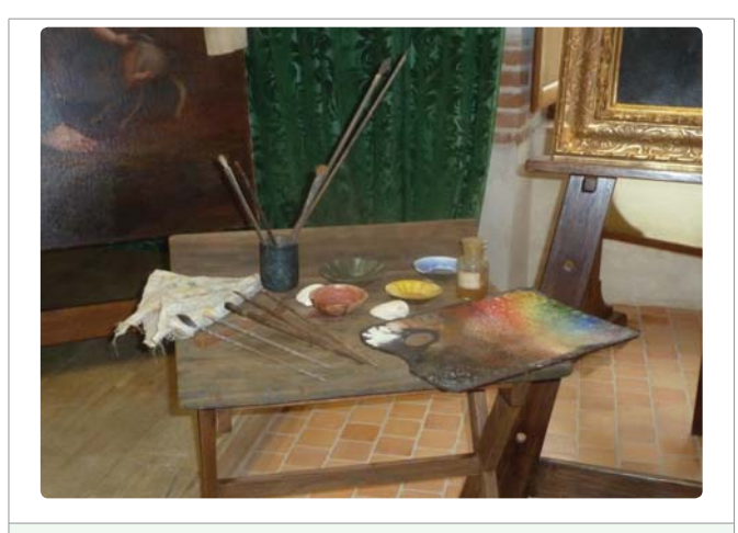
Figure 1: Leonardo da Vinci Museum. Le Clos Luce France.

A series of manifestations of Ehlers-Danlos' disease make it possible to explain the similarity of the faces of the patients concerned with that of the Mona Lisa. The texture of the skin first: it is thinned. This decrease in thickness results in a lessened filtering of the currents produced by static electricity and causes sensations of electric discharges in contact with a metallic object such as a caddy or a car door. This skin is flexible, stretches easily and does not fold easily during mimicry or under the effect of age. It is pale, ill-enduring the effects of ultra-violet radiations that provoke more readily erythema than a tanned skin. This "immobile" aspect of the face is further accentuated by a phenomenon that occupies a considerable place in the clinic of this pathology: a global proprioceptive disorder that is also expressed in the face. It is explained by the poor quality of the signals emitted by sensory sensors immersed in a tissue with modified mechanical behavior, most often in the sense of absence of reactivity. This influences the expressions of the face's muscles. For example, an emergency resident at the Hotel-Dieu hospital in