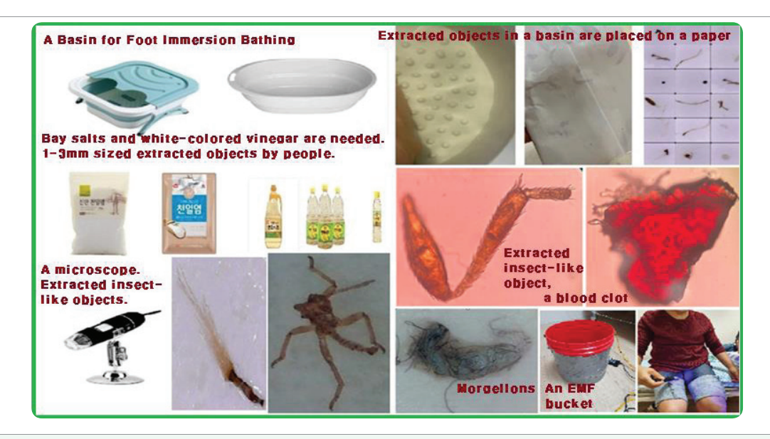
Figure 4: Materials necessary for the foot immersion bathing and some extracted organisms through the foot immersion bathing. For those who have severe adverse reactions by COVID-19 vaccines, whole-body immersion bathing is recommended instead of a foot immersion bathing. For the whole- body immersion bathing, 4.5 kg of bay salt is melted with a 500 ml vinegar in the half-hot water-filled bath. At first, the bathing time should not be over 15 minutes, and the progressively increase until one hour at a time. For the foot immersion bathing, pour hot water in a basin to the height of malleolus of the ankle. Then pour threecups of bay salt and one cup of vinegar. Remove all the impure foreign materials in the water to make it clear as pure water. The temperature of the basin water should be as warm as 42-45°C. Then Immerge your feet in the prepared water for about 25 minutes. Before this procedure, you need to wash your feet clearly. Remove your feet from the water of Immersion Bathing, then observe the water about 15 minutes. If you find out 1-3 small spots, speckles, rods, or spirals, carefully and selectively collect them on the white A4 paper. Then observe with the digital microscope at X1000 microscopic magnifying power. Pictures of the first-row show the water of the Foot Immersion Bathing, and foreign organisms that were extracted through the Foot Immersion Bathing. The second-row shows X400 microscopic pictures of the materials which were extracted from a patient who were experiencing adverse reactions because of COVID-19 vaccine. The microscopic pictures show an insect-like object and a newly-formed blood clot. The third-row shows somewhat hydra-like parasites, Morgellons, an EMF (Electro-magnetic field) bucket, and a person who were doing the foot immersion bathing.