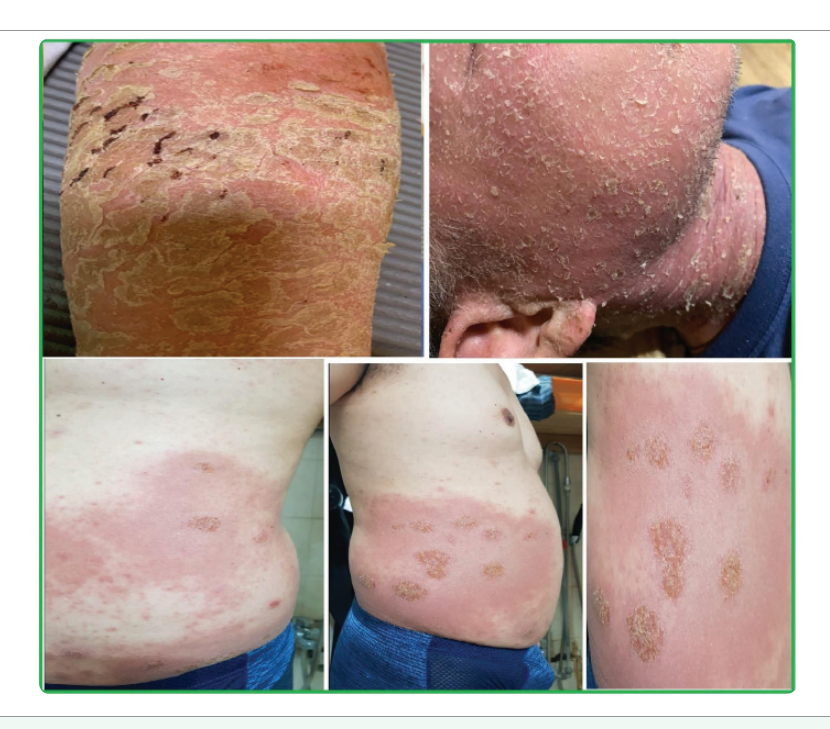
Figure 2: Skin lesions which occurred after COVID-19 vaccines. They were usually resilient and reluctant to respond to the prescriptions of dermatologists. They were improved with detoxifying methods for the COVID-19 vaccines.

Subacute dermatologic problems such as eczematous or scaly lesions which occurred after COVID-19 vaccines were usually resilient and reluctant to respond to the prescriptions of dermatologists (Figure 4). The lesions improved progressively with the detoxifying methods for COVID-19 vaccines for one month. But those skin lesions reaggravated when stopped for one week the detoxifying treatment. So, the lesions may need to detoxify at least for 4 months and needs to be followed up. Also, neurologic pathologies such as near paralysis of extremities, difficult to walk, sudden unknown convulsive movements, and autonomic palpitations of the extremities, were improved with detoxification methods written in the table 1. Abnormal neurologic features may include anosmia, stroke, paralysis, decreased eye function, facial numbness, and depression were difficult to cure by the usual and classic rehabilitation methods [11]. Intensity, frequency, and duration of myopericarditis symptoms after the COVID-19 vaccinations such as dyspnea, chest