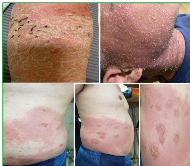
Figure 2: Skin lesions which occurred after COVID-19 vaccines. They were usually resilient and reluctant to respond to the prescriptions of dermatologists. They were improved with detoxifying methods for the COVID-19 vaccines.

Subacute dermatologic problems such as eczematous or scaly lesions which occurred after COVID-19 vaccines were usually resilient and reluctant to respond to the prescriptions of dermatologists (Figure 4). The lesions improved progressively with the detoxifying methods for COVID-19 vaccines for one month. But those skin lesions reagravated when stopped for one week the detoxifying treatment. So, the lesions may need to detoxify at least for 4 months and needs to be followed up. Also, neurologic pathologies such as near paralysis of extremities, difficult to walk, sudden unknown convulsive movements, and autonomic palpitations of the extremities, were improved with detoxification methods written in the table 1. Abnormal neurologic features may include anosmia, stroke, paralysis, decreased eye function, facial numbness, and depression were difficult to cure by the usual and classic rehabilitation methods [11]. Intensity, frequency, and duration of myopericarditis symptoms after the COVID-19 vaccinations such as dyspnea, chest