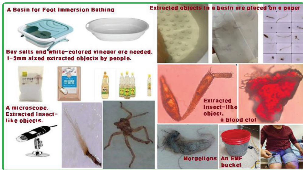
Figure 4: Materials necessary for the foot immersion bathing and some extracted organisms through the foot immersion bathing. For those who have severe adverse reactions by COVID-19 vaccines, whole-body immersion bathing is recommended instead of a foot immersion bathing. For the whole-body immersion bathing, 4.5 kg of bay salt is melted with a 500 ml vinegar in the half-hot water-filled bath. At first, the bathing time should not be over 15 minutes, and the progressively increase until one hour at a time. For the foot immersion bathing, pour hot water in a basin to the height of malleolus of the ankle. Then pour three-cups of bay salt and one cup of vinegar. Remove all the impure foreign materials in the water to make it clear as pure water. The temperature of the basin water should be as warm as 42-45°C. Then Immerse your feet in the prepared water for about 25 minutes. Before this procedure, you need to wash your feet clearly. Remove your feet from the water of Immersion Bathing, then observe the water about 15 minutes. If you find out 1-3 small spots, speckles, rods, or spirals, carefully and selectively collect them on the white A4 paper. Then observe with the digital microscope at X1000 microscopic magnifying power. Pictures of the first-row show the water of the Foot Immersion Bathing, and foreign organisms that were extracted through the Foot Immersion Bathing. The second-row shows X400 microscopic pictures of the materials which were extracted from a patient who were experiencing adverse reactions because of COVID-19 vaccine. The microscopic pictures show an insect-like object and a newly-formed blood clot. The third-row shows somewhat hydra-like parasites, Morgellons, an EMF (Electro-magnetic field) bucket, and a person who were doing the foot immersion bathing.