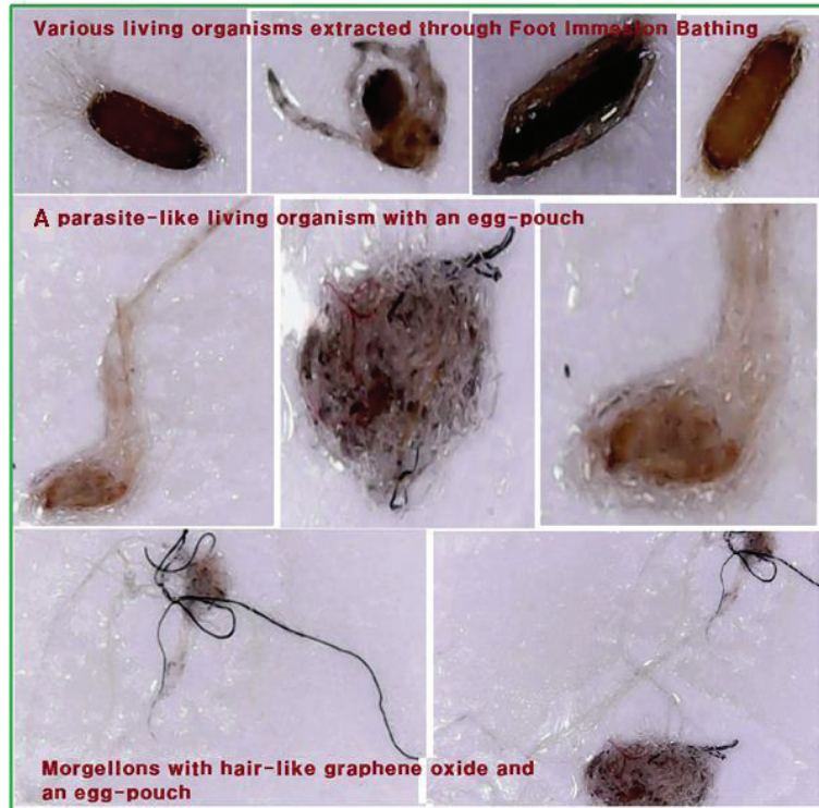
Figure 3: Living organisms extracted by a foot immersion bathing method. The first-row shows various kinds of living organisms extracted through a foot immersion bathing. The second-row shows a questionable parasite-like living organisms with an egg pouch and an egg-pouch or a Morgellons with hair-like graphene oxides attached to it. The third-row shows Morgellons with hair-like graphene oxide and an egg pouch. Currently, this kind of Foot Immersion Bathing are booming in Korea. These pictures were posted by a Moderna COVID-19 injected person who had experienced nerve paresis and could not even walk. After a detoxification treatment, her paresis was mostly gone, and she participates in the Anti-COVID-19 vaccination rally.