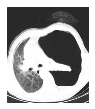
Figure 3: CT scan shows colon in hemithorax with pneumothorax.