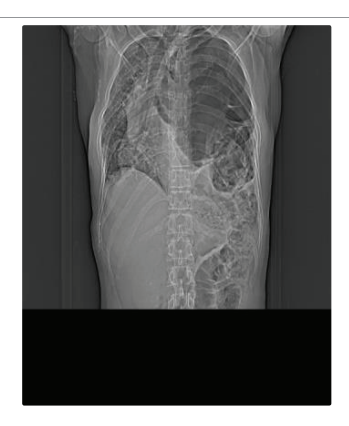
Figure 1: CT scan shows colon in hemithorax with pneumothorax.