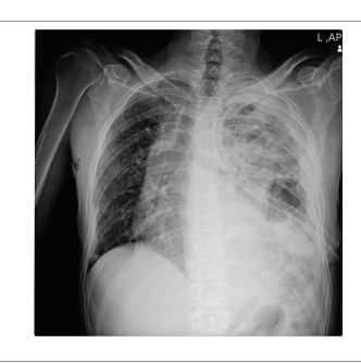
Figure 5: Post chest tube chest x-ray.