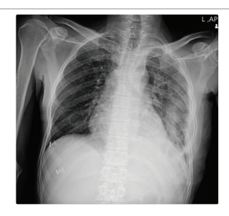
Figure 6: Post chest tube removal chest x-ray shows finding of diaphragmatic

extravasation [10]. Treatment of diaphragmatic hernia is surgical via laparotomy or thoracotomy. Acute cases are better managed via a laparotomy as this also rules out and treats associated intra abdominal organ injuries. Delayed cases, however, are better treated via a thoracotomy or thoracoabdominal approach because of intrathoracic adhesions [11]. In our patient, laparotomy was performed first however no adhesion was encountered between the herniated organs and the lungs despite presenting after 2 years of the blunt abdominal injury, and after finding the pathology, the transvers loop colostomy was implanted for the patient from the transverse colon perforation site, and then thoracotomy was performed. The thoracic cavity was flushed, and the diaphragm was repaired, and two chest tubes were inserted. Due to the contamination of the thorax cavity with feces, our concern was the formation of abscesses and reinfection, which was continuously the washing of the thorax cavity through the thoracic tubes. Fortunately, no side effects were reported.