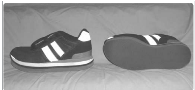
Figure 2: Example of modified shoes.