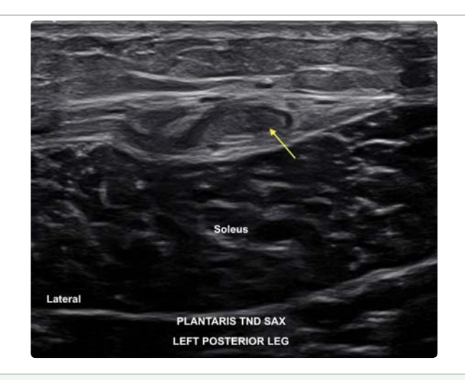
Figure 1A: Sonographic evaluation of the plantaris tendon 2 hours post-injury A: Complete rupture of the tendon midsubstance (arrow).

Two weeks following the date of injury, he returned for routine follow up examination. Ultrasound demonstrated resolution of hematoma and interval progression of heterogeneous scar tissue along the course of the ruptured tendon. The patient continued to progress and returned to his previous level of activity as a Division 1 tight end that week without incident.