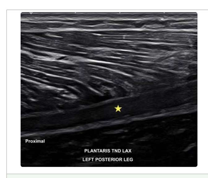
Figure 1C: Focal hematoma within the medial gastrocnemius/soleus aponeurosis at the site of injury (star).