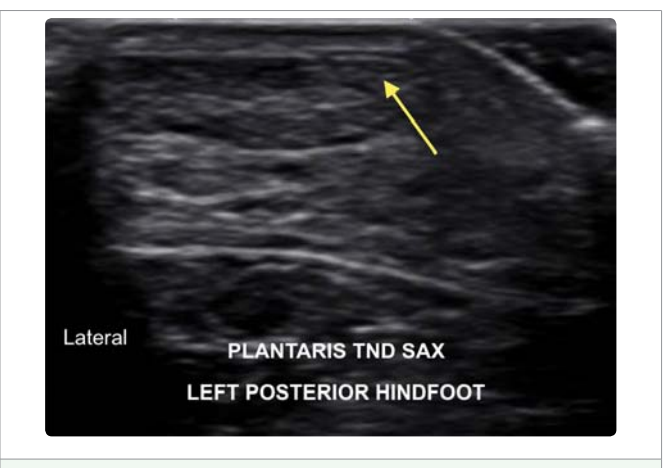
Figure 1B: Intact distal plantaris tendon (arrow).