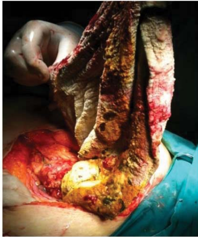
Figure 4: Intraoperative picture of a retained sponge removed after exploratory laparotomy.