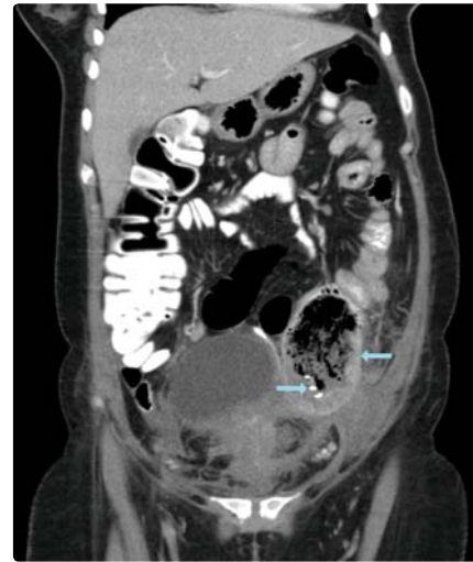
Figure 2: Computed tomography of the abdomen and pelvis demonstrating a mottled lesion in the left lower abdomen with a coiled metallic density (arrows).

Gossypiboma retained within the abdomen can have numerous adverse sequela. Acute peritonitis can develop as a result of acute inflammation around the retained foreign body [91,92]. Chronic inflammation can lead to the formation of adhesions, which can precipitate intestinal obstruction [29,30]. Inflammation of surrounding viscera can result in the formation of fistulae and migration of the sponge into the lumen [14,15,54,94]. This in turn can lead to intestinal obstruction [95,96] or, in some cases, spontaneous expulsion of the retained sponge [14-18]. Visceral perforation can also occur with resultant secondary peritonitis [36,97]. In rare cases, the retained gauze may transmigrate into the stomach to result