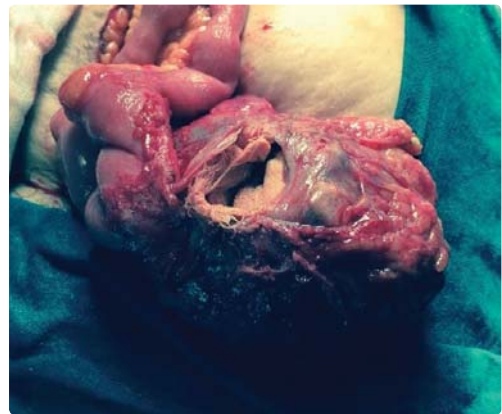
Figure 3: Intraoperative picture of a lump adherent to bowel loops with a gossypiboma visible inside.

Copyright © 2014 K. N. Srivastava and Amit Agarwal. Reproduced from: Srivastava KN, Agarwal A. (2014) Gossypiboma posing as a diagnostic dilemma: a case report and review of the literature. Case Rep Surg. 2014: 713428. This is an open access article distributed under the Creative Commons Attribution License, which permits unrestricted use, distribution, and reproduction in any medium, provided the original work is properly cited.