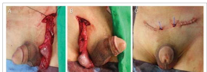
Figure 2: Intra-operative findings, both spermatic cord with testis was fully dissected from surrounding structures, A: Lt testis with spermatic cord B: Right testis with spermatic cord. Post-op findings C: Both testes were fixed at dartos pouch.